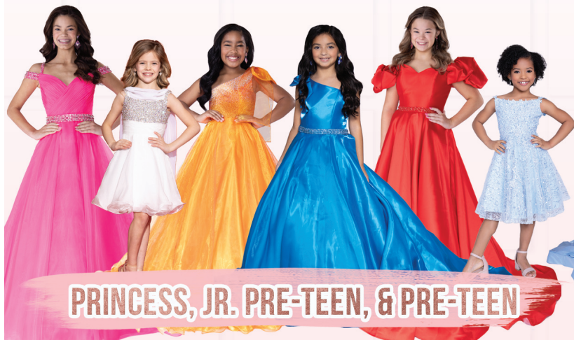
PRINCESS, JR. PRE-TEEN, & PRE-TEEN