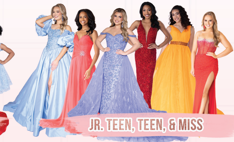
JR. TEEN, TEEN, & MISS